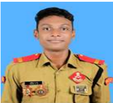
UO AKHIL AS