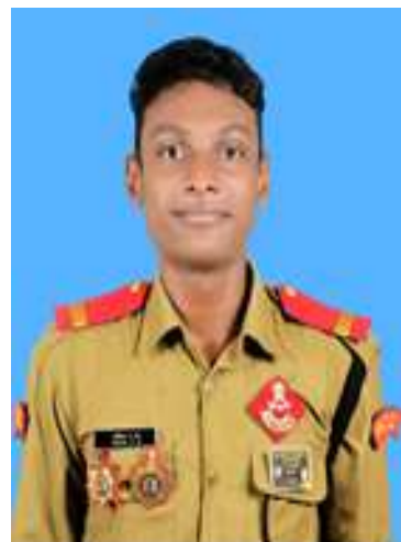
UO AKHIL AS