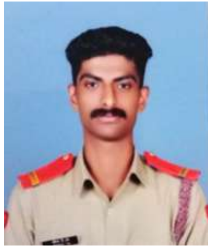
UO ABHINAV VR